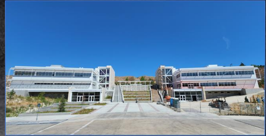
CCC Lower Plaza / Recent CalWORKs Meeting w/ Graciela Martinez