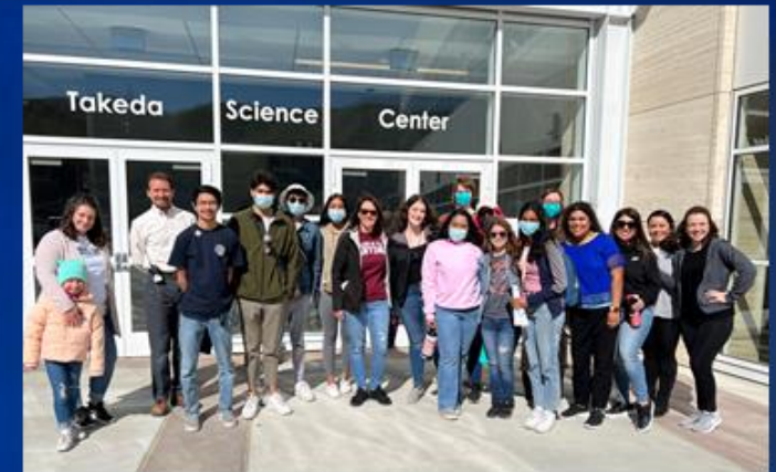
Student Outreach Event