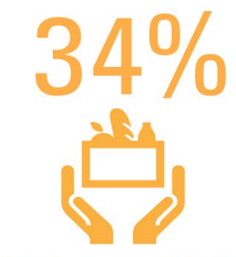
of students report their colleges have provided food support, like access to food pantries.

of students report skipping a meal or reducing how much they are eating as a result of the pandemic