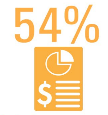
of students are uneasy about their personal finances over the coming few months